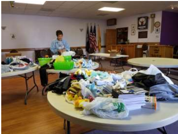
An Assortment of Clothes, Bunnies, Baskets, Note Pads, Pens, Deodorants, Shampoos, Cheese Crackers, Socks, Chocolate Covered Bunnies, Kleenex Tissues.